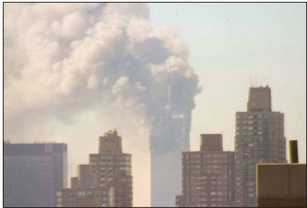
The New York skyline filled with smoke prior to the Twin Towers collapsing on Sept. 11,2001.

"It's important to continue See 9/11 Program, Page 8A